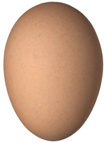
IDEAL EGG Clean, free of cracks, correct shape, within acceptable weight range