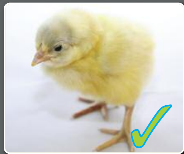
Light grey legs and feathers