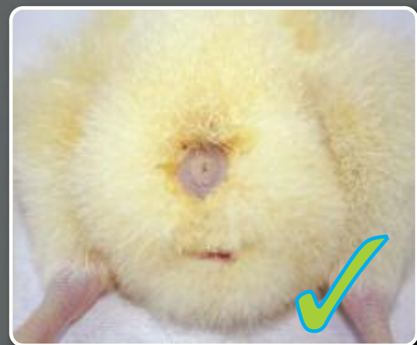
Well healed navel