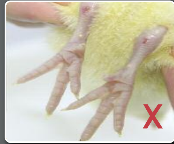
Open cut/abrasion on hocks