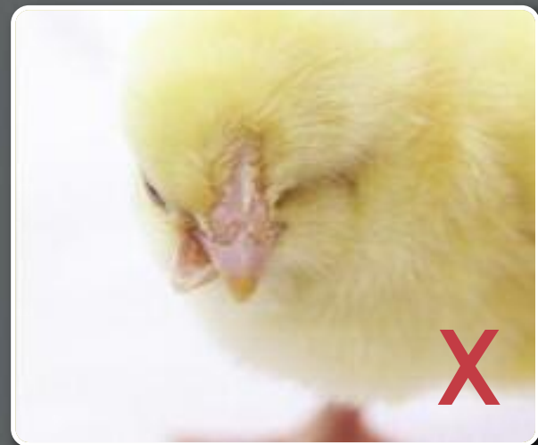
Cross beak/anatomical defects