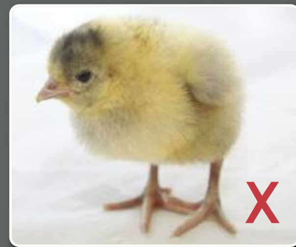
Majority dark grey/black