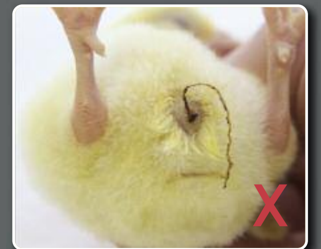
Large/long string navel