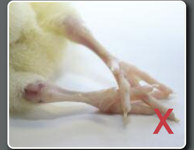
Damage to hocks