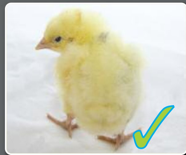
Small grey spot