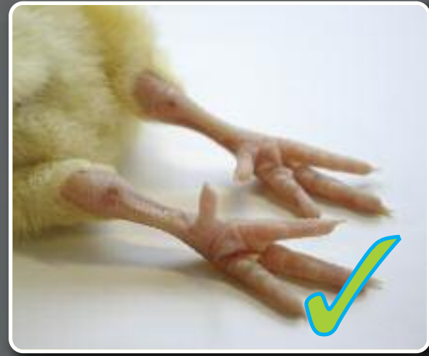
Slight blushing/no abrasion