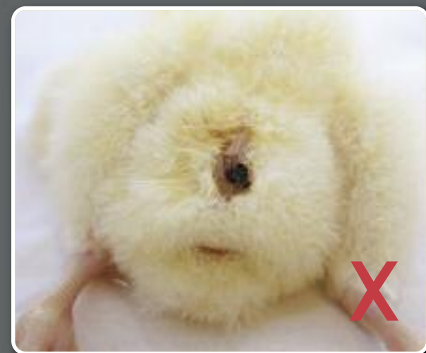
Large button navel